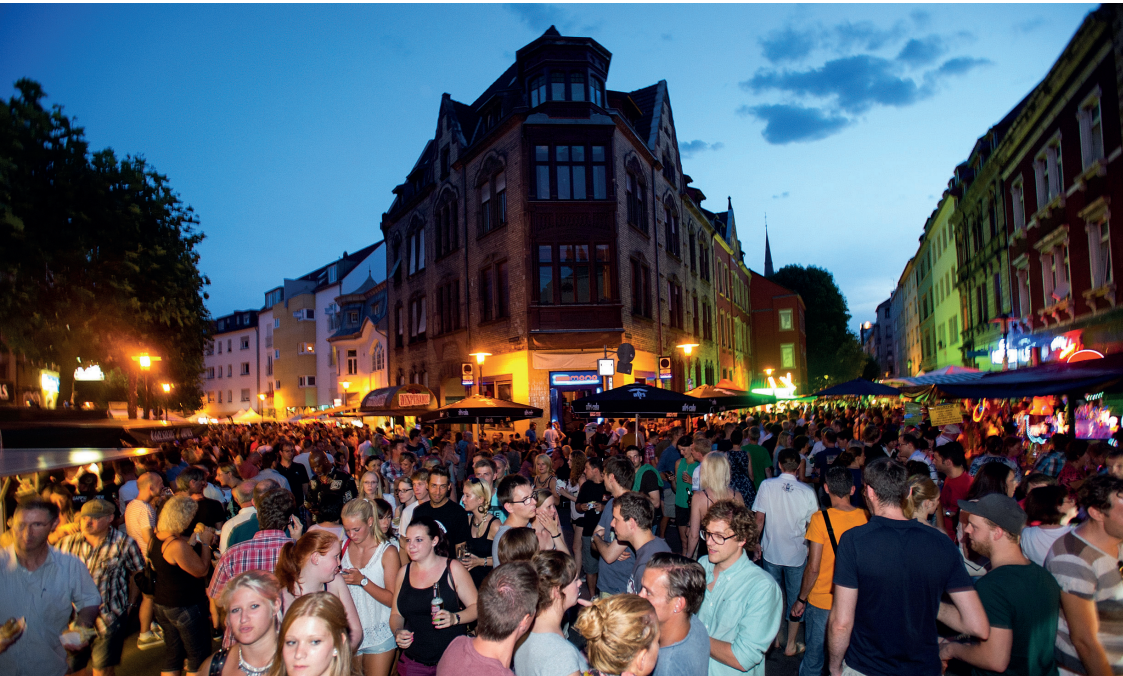
The Nauwieser Festival attracts plenty of students to this vibrant and dynamic part of Saarbrücken.

The river is at the focus of Saarbrücken's summer festival 'Saarspektakel' during which teams from Saarland University take part in the ever popular dragon boat races. Other summer events attracting thousands of visitors to the city are the Old Town Fair (Altstadtfest) and the Nauwieser Festival.